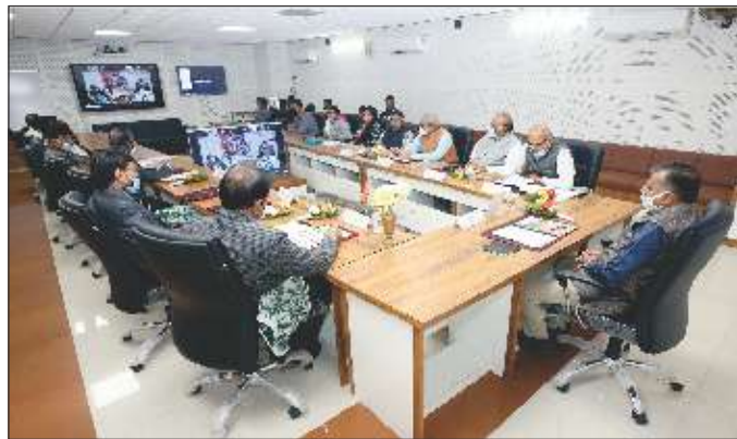
University Video Conference Hall