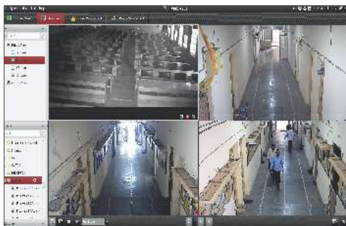
CCTV Surveillance System