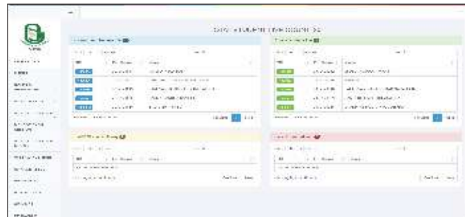
JAU Online Examination System