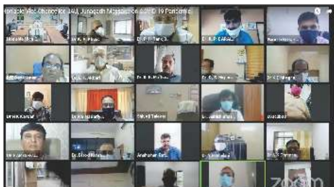
Interactions with the faculties of JAU through online mode during Covid-19 pandemic